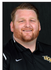
Bryan Hill Equipment